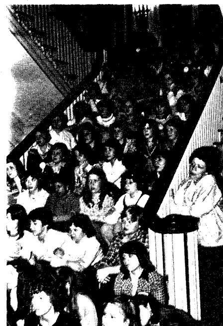
Closing brings many serious thoughts

The delegates then ate lunch and went their separate ways. Once again delegates left another IASC sponsored event with good feelings and much ambition in their hearts and minds.